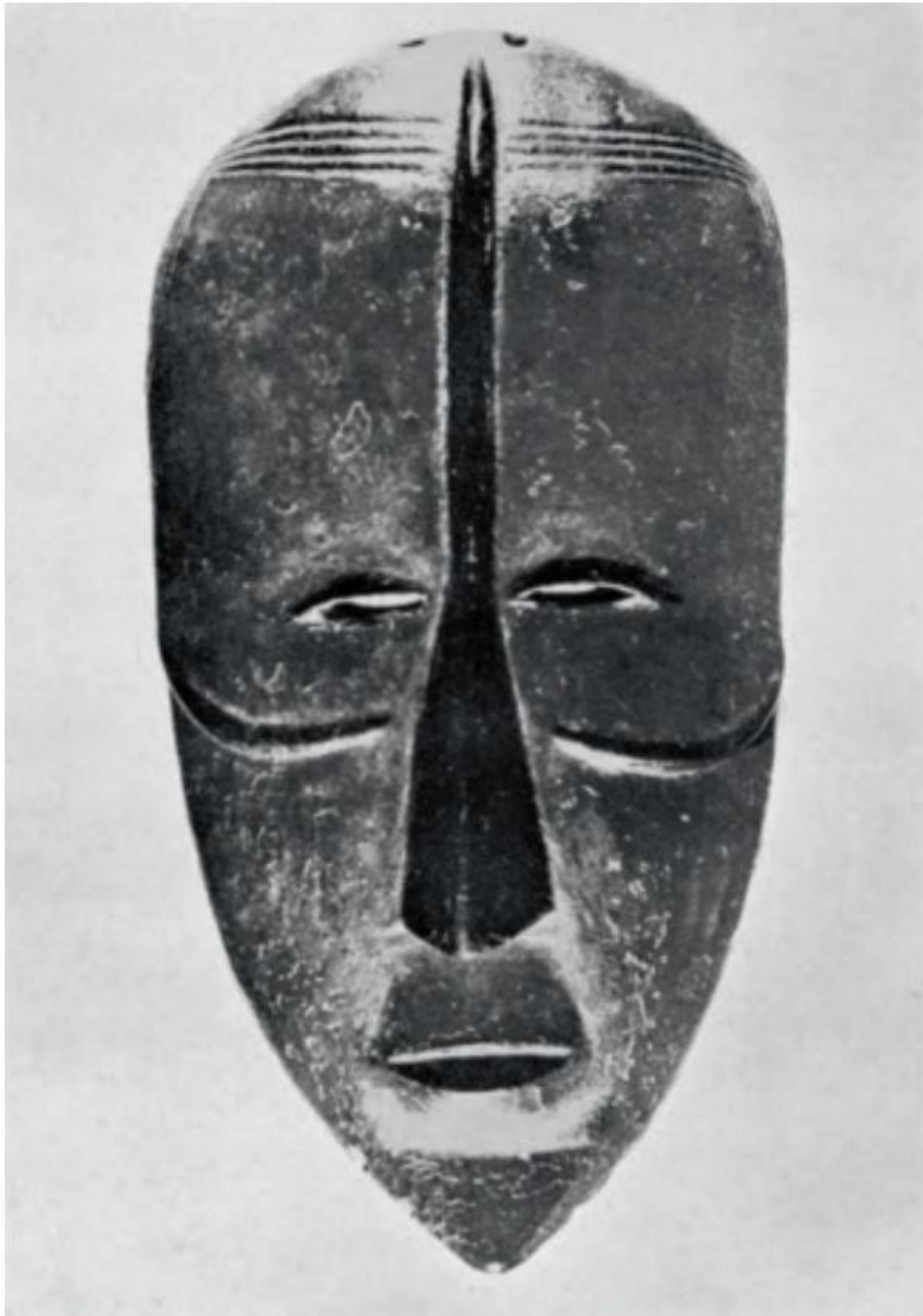
Art Afrique Noire. Arles : Musée Reattu, 1954, no.59, plate II