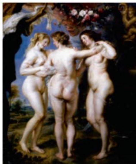
Three Graces by Rubens