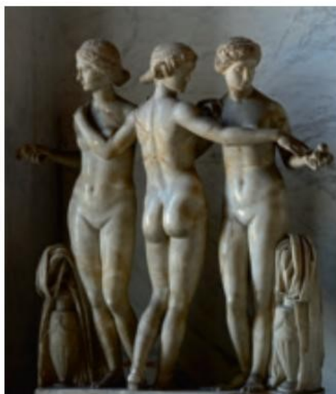
Three Roman Graces, copy of the first half of 2nd century CE after a Hellenistic original