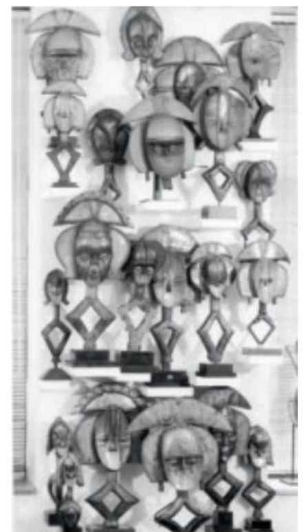
The Arman collection of Kota in New York