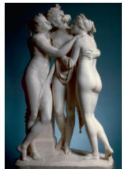
Three Graces by Canova